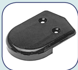
F90-0001 End Cap