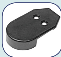
F90-0002 End Cap