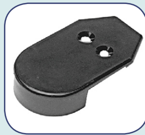
F90-0002 End Cap